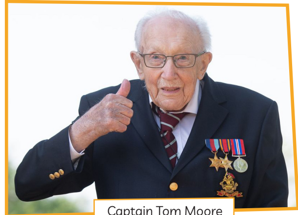
Captain Tom Moore